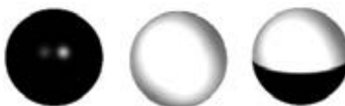
Figure 3. Which colour the ball a-is?

has a different perspective (context). And our contexts do not affect the colour of the ball. We can only get an idea of the complete colour of the ball by taking into account as much perspectives (re-beings) as we can. (Note that a usual ball is not infinite as the a-being is). Figure 3 shows three perspectives of this supposed ball.